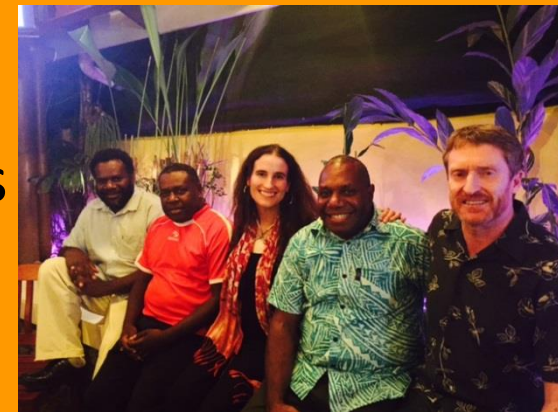
Pacific Civil Registrar Network