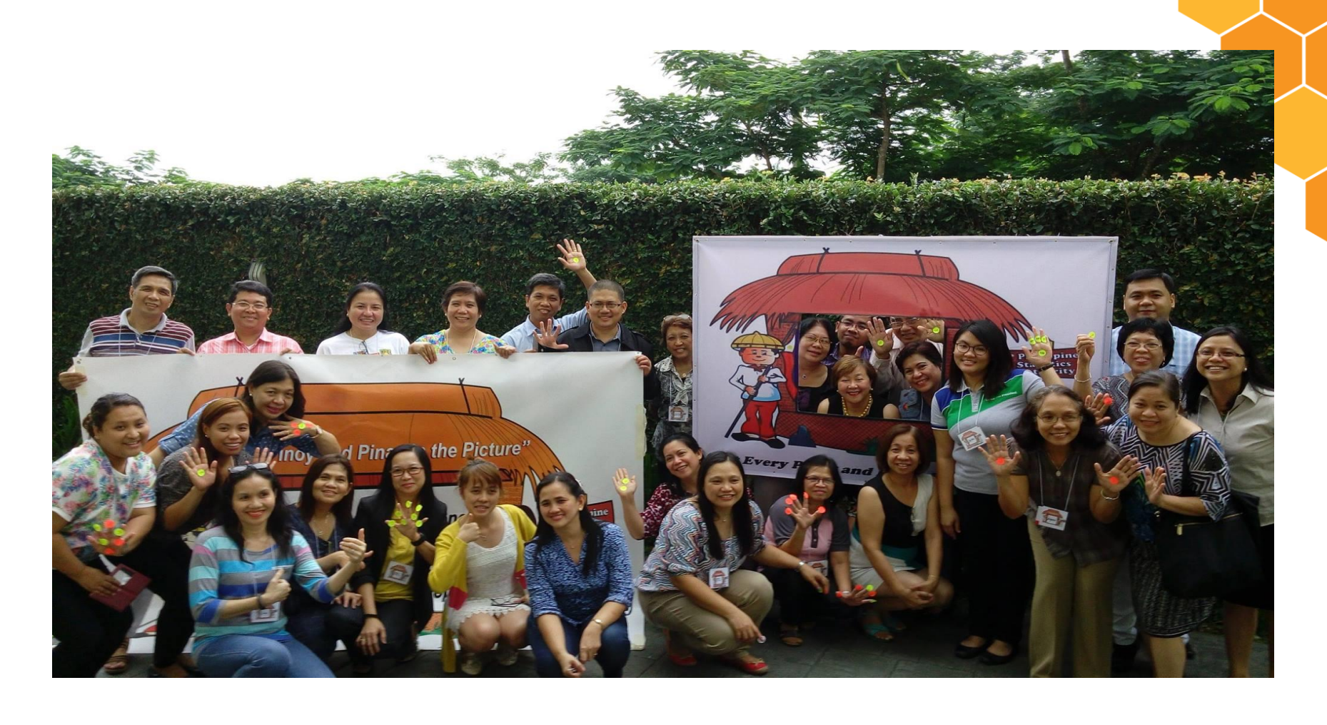
Thank you and Mabuhay! www.psa.gov.ph