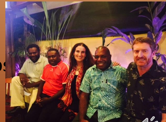
Pacific Civil Registrar Network